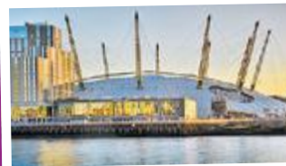
DOME FROM HOME: The O2

Galgorm Resort and Spa, Northern Ireland Known as a "thermal village" this award-winning spa is 30-minutes from Belfast and has indoor and outdoor facilities including a pool, snow cabin and hot tubs. Offer: Get 20% off the Thermal Spa Special, which is down to £60pp including lunch.