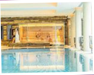
THERMAL VILLAGE: Galgorm Resort and Spa