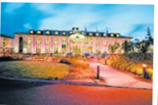
RURAL RETREAT: The Vale