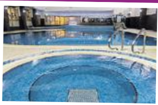
FIRE AND ICE: The Belfry